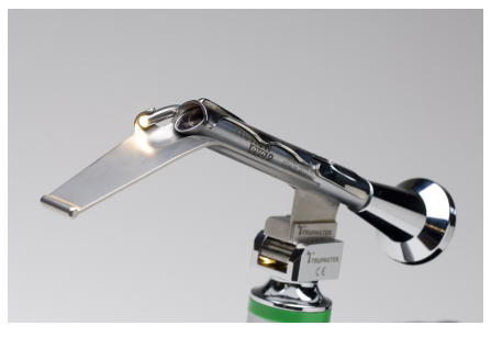
Truview optical laryngoscope

Truview - Rigid indirect laryngoscope using prisms to improve the view.