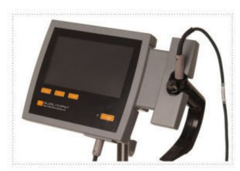
Angulated video intubation laryngoscope

The view can also be seen on the video monitor unit.