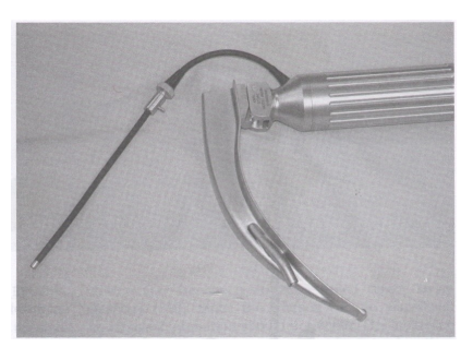
Storz Macintosh intubating laryngoscope<sup>1</sup>

d. Storz Macintosh/Miller intubating laryngoscopes – Fiberoptic bundle is introduced into the blade up to 2/3 length.