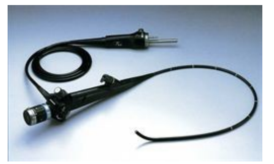
Flexible fibreoptic endoscopes

These are the most versatile laryngoscopes in difficult airway situation.