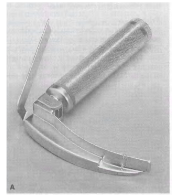
Curved flexible tip laryngoscope (McCoy)