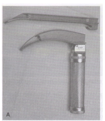
Reusable handle with curved (Macintosh) & straight (Miller) blades