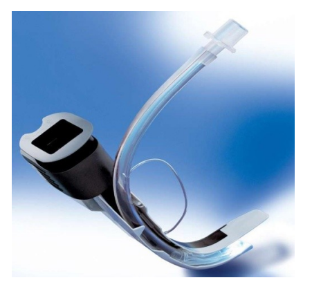
Airtraq optical laryngoscope

Truview - Rigid indirect laryngoscope using prisms to improve the view.