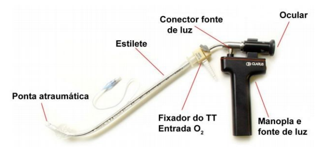
Shikani optical stylet

Paediatric stylet accepts size 3.5 ETT and above.